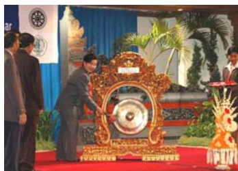
Conference Inauguration by DR dr Siti Fadilah Supari