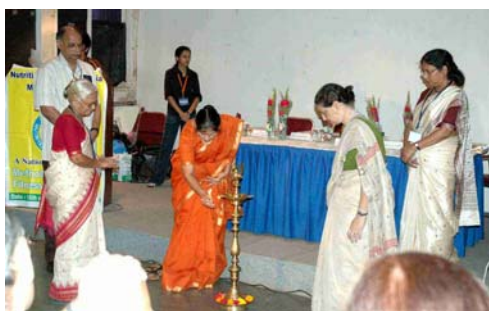
Inaugural session – lighting the candle

A two-day National Workshop on “Methodologies for Fitness Assessment” was organized by the Nutrition Society of India (NSI) - Mumbai Chapter on 15 & 16 September, 2006 at the SNTD Auditorium, Mumbai.