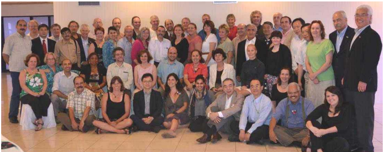
Delegates at the council meeting at Recife, 12 February 2012. Anyone seems familiar?

The IEA (International Ergonomics Association) began the year with preparation of the Council meeting and the IEA Triennial Congress in Recife, Brazil from February 11 to 16, 2012. These events were in Brazil and in Latin America the very first time ever in the IEA history. It symbolizes the increasing development of ergonomics worldwide as well as more influence and needs of ergonomics in developing countries. The updated IEA rules and the operation procedures along with other important items were discussed and approved by the council. New officers were elected by the council members and the executives were formally transferred in the closing ceremony of the congress.