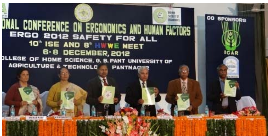
Release of the HWWE 2012 Souvenir

The entire conference was well covered in the local print media, including Punjab Kesari and The Pioneer.